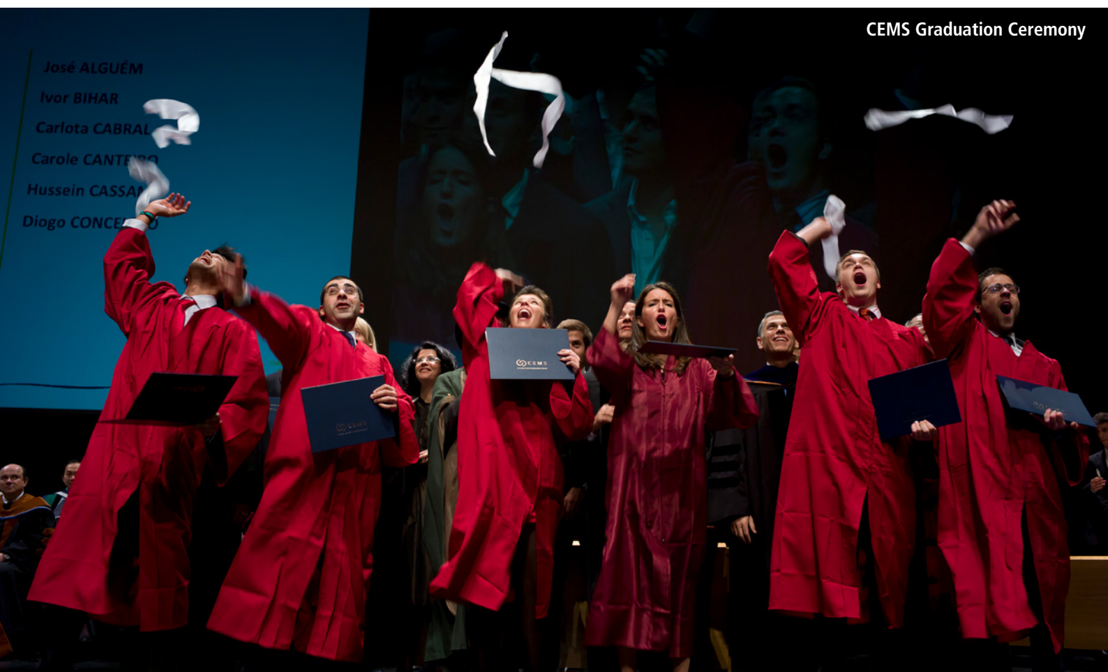
CEMS Graduation Ceremony

One strong feature of the programme is the practical contact you, as a student, will receive. Guest lecturers and skill seminars establish and promote direct exchange between companies and students. We emphasise academic rigour and practical relevance to educate you through broadly-skilled and international management leaders.